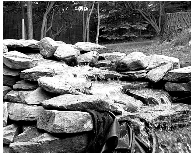
ADK Mountain Landscaping Co. gave our reading garden fountain its first test in June! Join us on Saturday, July 22 from 4-6 for the dedication.