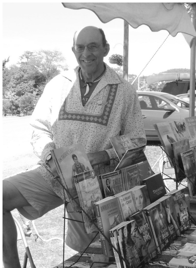
Joe Bruchac at the Adirondack Story and Music Fest at our new location held under a tent in the center of the village of Old Forge.

Evening Book Group: meets the last Wednesday of each month at 6:30 pm at the Library. On September 28 they will discuss "Blink" by Malcolm Gladwell. On