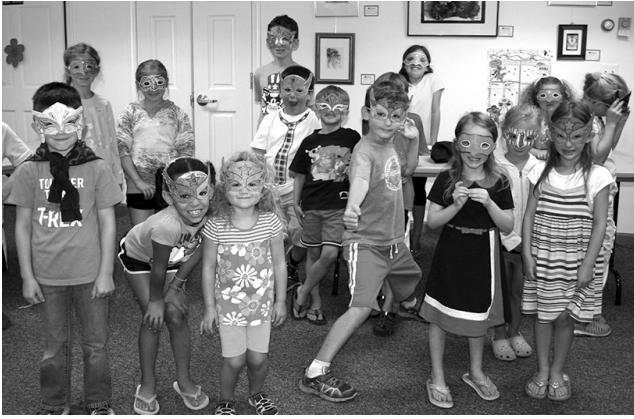
Some of the Summer Reading Program participants don their decorated masks to get into the superhero act!

your flowers in. All other supplies provided. Call the Library at 369-6008 to register.